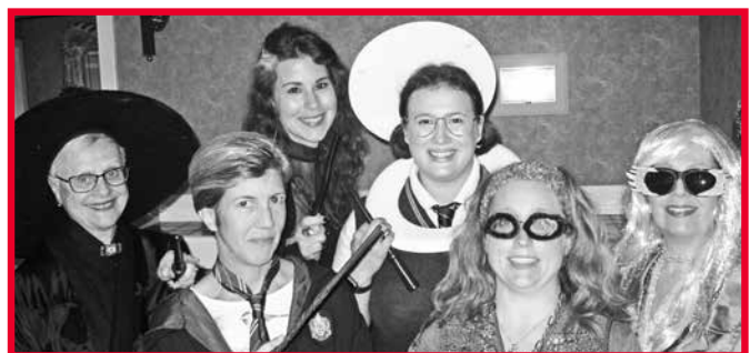
Harry Potter-themed costume contest participants.

Following dinner on Thursday evening there were several activities including swimming in the indoor pool, board games, and our annual karaoke and dance with a Harry Potter-themed costume contest. Many attendees dressed up as various characters from the Harry Potter movies. "Moaning Myrtle" won the prize for best cos-